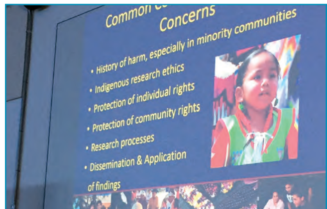
Research concerns presented at Behavioral Health Institute.