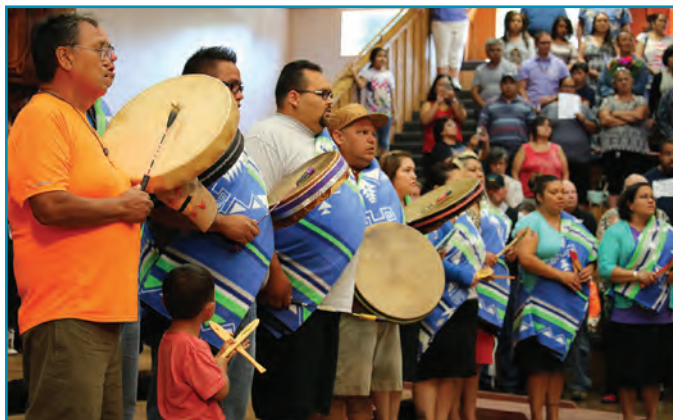
Northwest Indian College singers.

The NWIC Behavioral Health Research Network project used Community Based Participatory Research (CBPR) approach to develop, implement, analyze, and report the results of an NWIC student behavioral health survey while mentoring students to conduct research. Student researchers trained in the CBPR surveyed American Indian, Alaska Native, and other Indigenous (AI/AN) students at NWIC regarding resiliency and risk factors, including former students. Based on the survey results, they are identifying possible interventions that NWIC could implement to increase resiliency and decrease risk factors impacting NWIC AI/AN students' behavioral health and retention.