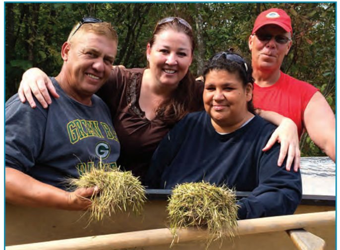
Keweenaw Bay Ojibwa Community College wild rice project.

The goals of this project are: (1) to build capacity in KBOCC staff and students to conduct research on behavioral health; and (2) introduce culturally appropriate and informed adaptations of evidence-based, best and promising practices to meet identified behavioral health needs. KBOCC is conducting a college-specific needs assessment following a community-wide assessment conducted in the following academic year.