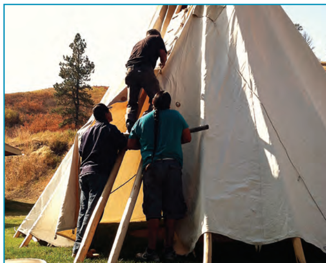
Stone Child College tipi demonstration during Native American Week.

SCC's project was designed to identify, develop, pilot, and evaluate intervention strategies and models that address significant Chippewa Cree behavioral health issues, especially related to substance abuse and mental health on the Rocky Boy Indian Reservation in Montana. The project was intended to "improve ownership that Chippewa Cree peoples' experience with regard to local research." The project: (1) conducted a needs assessment on the reservation, which identified a strong interest community in strengthening tribal cultural programming, specifically in Native language, and a need for enhanced communication about the educational and support services provided by SCC; (2) initiated a student-driven CBPR program focused on substance abuse and mental health treatment and prevention with an emphasis on historical trauma through their Rural Health Associate Degree Program; and (3) established the foundation of a behavioral health research infrastructure through the development of an SCC Office of Institutional Research.