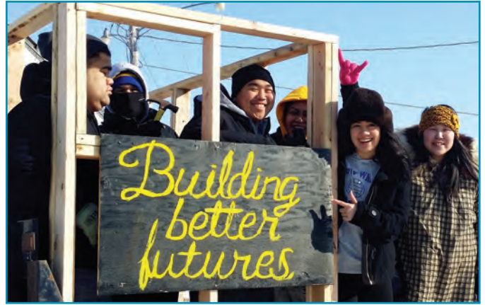
Ilisaġvik College students participate in the yearly Spring Parade in Barrow, AK.

Ilisaġvik's community based research project is assessing the behavioral health needs of North Slope residents, including the